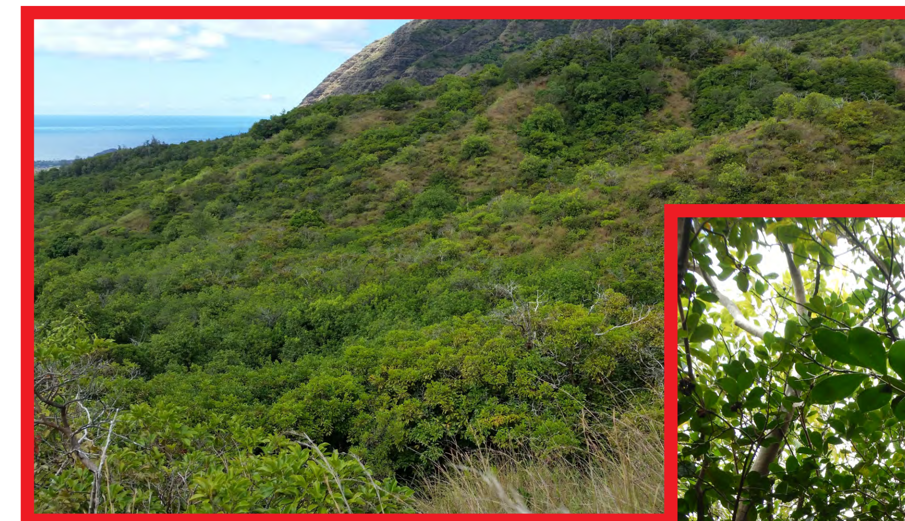
Test plot location, Mākaha Valley

Based on this successful introduction of T. ovatus across Hawai`i, and with the support of the State of Hawai`i Department of Land and Natural Resources (DLNR), BWS initiated a T. ovatus release in test plots on BWS watershed land. As strawberry guava has been overtaking much of the BWS watershed land in Mākaha, two 20 ft x 20 ft test plots were sited in this region, along a southwest-facing ridge in the back of the valley.