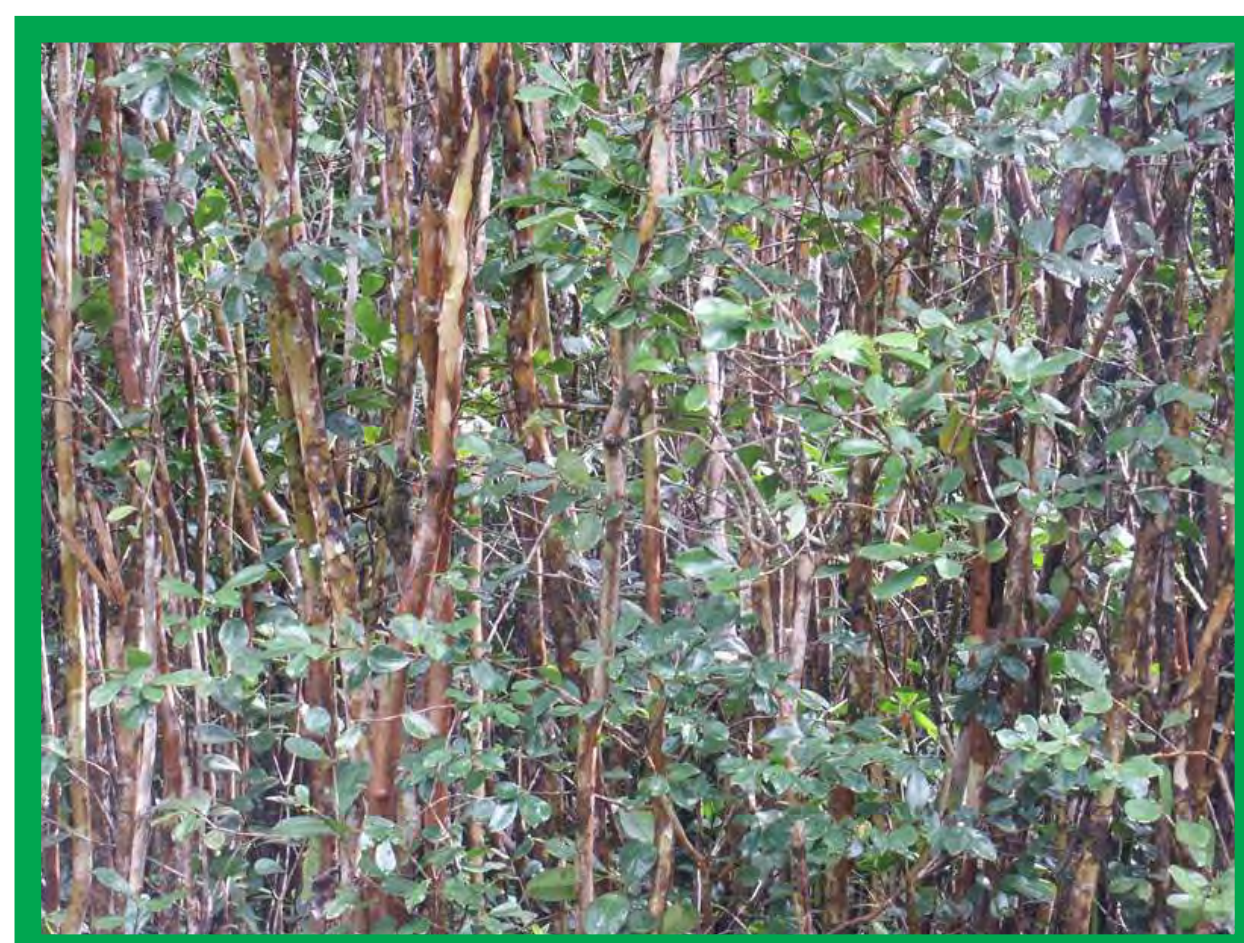
Typical dense stand of strawberry guava

Strawberry guava ( Psidium cattleianum ) is considered to be one of the most destructive invasive plant species in Hawai`i. This species was brought to Hawai`i in 1825 for its fruit and ornamental attributes. Due to a lack of natural predators and diseases in Hawai`i compared to its native Brazil, the plant has spread rapidly across the islands via both shoots and seeds, replacing many hundreds of thousands of acres of native forest with monotypic stands of the plant. For native forest replaced by strawberry guava, the rainfall lost to groundwater recharge due to this plant, is thought to be around 25 percent of total rainfall.