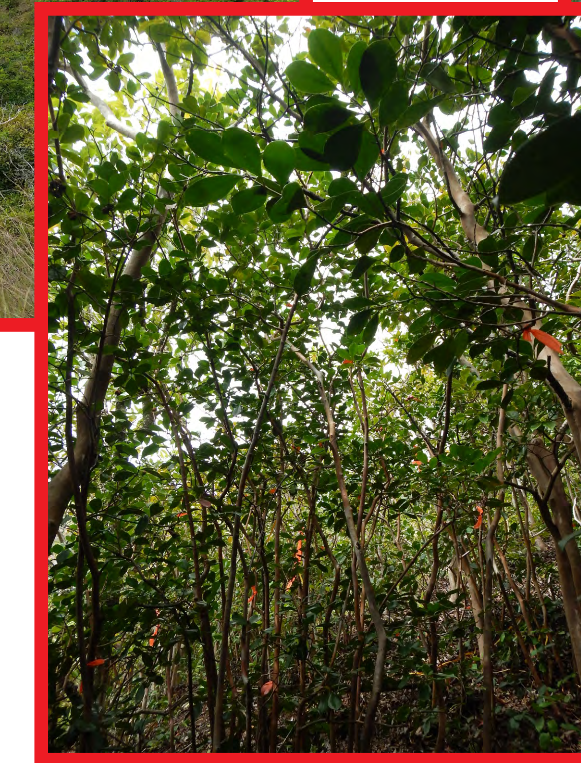
Strawberry guava on test plot, prior to "topping"