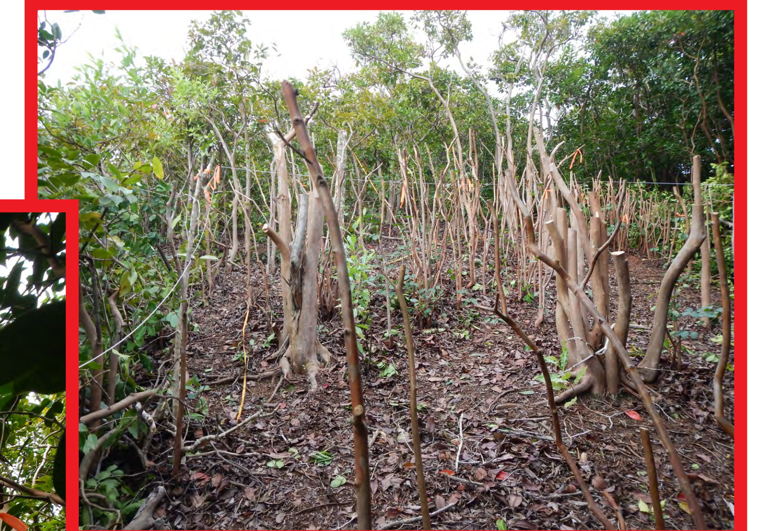
Strawberry guava on test plot, after "topping"

Drawing from methods used successfully in the previous T. ovatus releases in Hawai`i, the test plots were prepared by "topping" the existing strawberry guava, waiting until the new leaves began to "flush", then planting several young strawberry guava already inoculated with T. ovatus throughout the plots. The test plots were prepared in late 2017, and inoculated in early 2018.