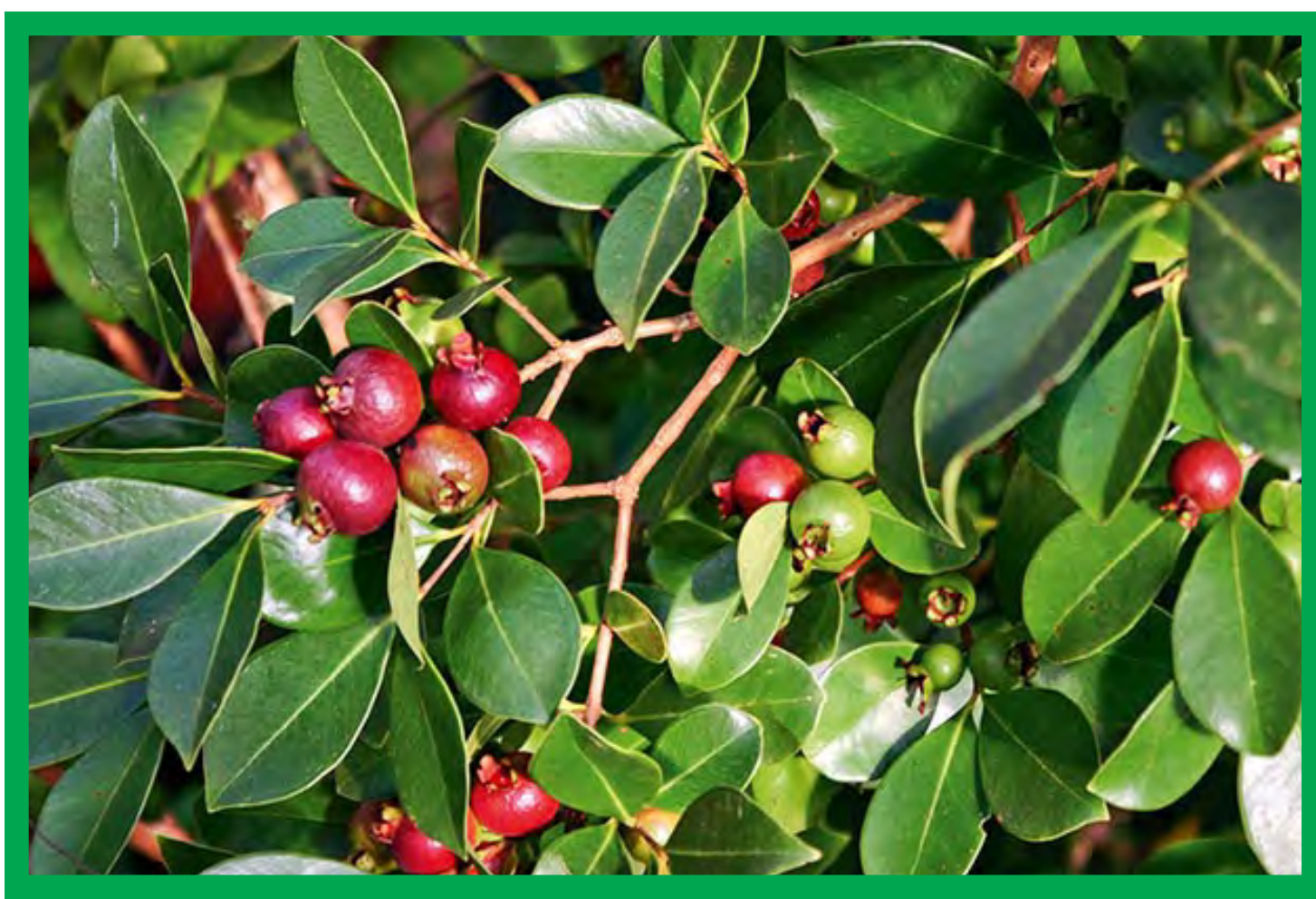
Strawberry guava ( Psidium cattleianum )

The Honolulu Board of Water Supply (BWS) Watershed Program works to ensure an adequate supply of fresh water for current and future generations, by protecting the ability of O`ahu's watersheds to capture and store rainfall in the aquifers below. This ability is critical, as rainfall is the sole natural source of fresh water supply for the island.