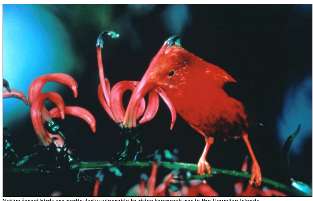
Native forest birds are particularly vulnerable to rising temperatures in the Hawaiian Islands.

research to predict climate change impacts in Hawai'i is underway. A concerted effort to share this information with the public in a proactive manner is now required. HCA has committed to developing a clearly articulated message and educational materials that communicate the complexities of climate change and the actions that may mitigate likely impacts.