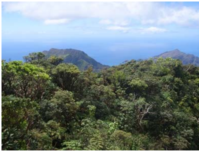
At high elevations in Hawai'i the ambient temperature is rising faster than the global average.

In Hawai'i, the seasonal and geographic distribution of rainfall and temperature has combined with steep, mountainous terrain to produce a wide array of island-scale climate regimes. These varying regimes in turn have supported the diversification of Hawai'i native plants and animals. Increasing amounts of anthropogenic greenhouse gases will likely alter the archipelago's terrestrial and marine environments by raising air and sea surface temperatures, changing the amount and distribution of precipitation, raising sea level, increasing ocean acidification, and exacerbating severe weather events.